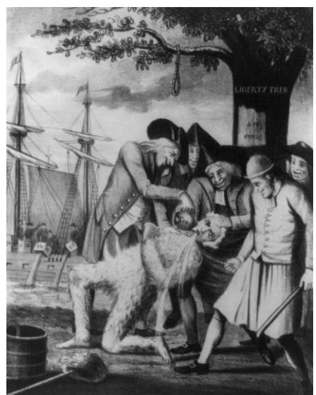
(Tarring and Feathering of a British Loyalist)