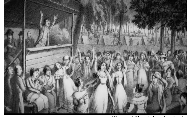
(Second Great Awakening)

Your beloved instructor will not take attendance on Mondays and Wednesdays. You are responsible for all of the material covered in lectures (absence is not a