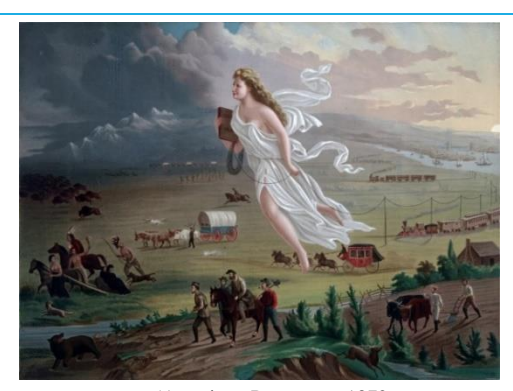
(American Progress - 1872)

Purdue University is committed to maintaining a community which recognizes and values the inherent worth and dignity of every person; fosters tolerance, sensitivity, understanding, and mutual respect among its members; and encourages each individual to strive to reach his or her own potential. In pursuit of its goal of academic excellence, the University seeks to develop and nurture diversity. The University believes that diversity among its many members strengthens the institution, stimulates creativity, promotes the exchange of ideas, and enriches campus life. Inappropriate behaviors will be addressed with disciplinary action, which may include being referred to the Office of the Dean of Students. Purdue's nondiscrimination policy can be found at: <a href="http://www.purdue.edu/purdue/ea eou statement.htm">http://www.purdue.edu/purdue/ea eou statement.htm</a>