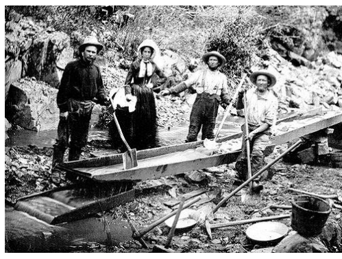
(California Gold Rush)