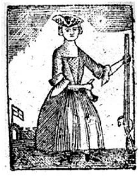
(Armed Woman in the Revolutionary War)