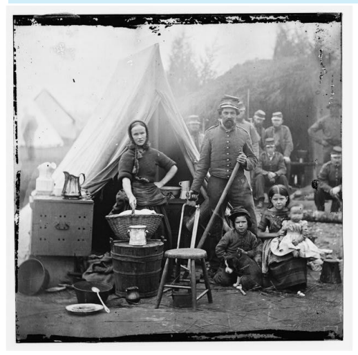
(Union military camp in the Civil War)